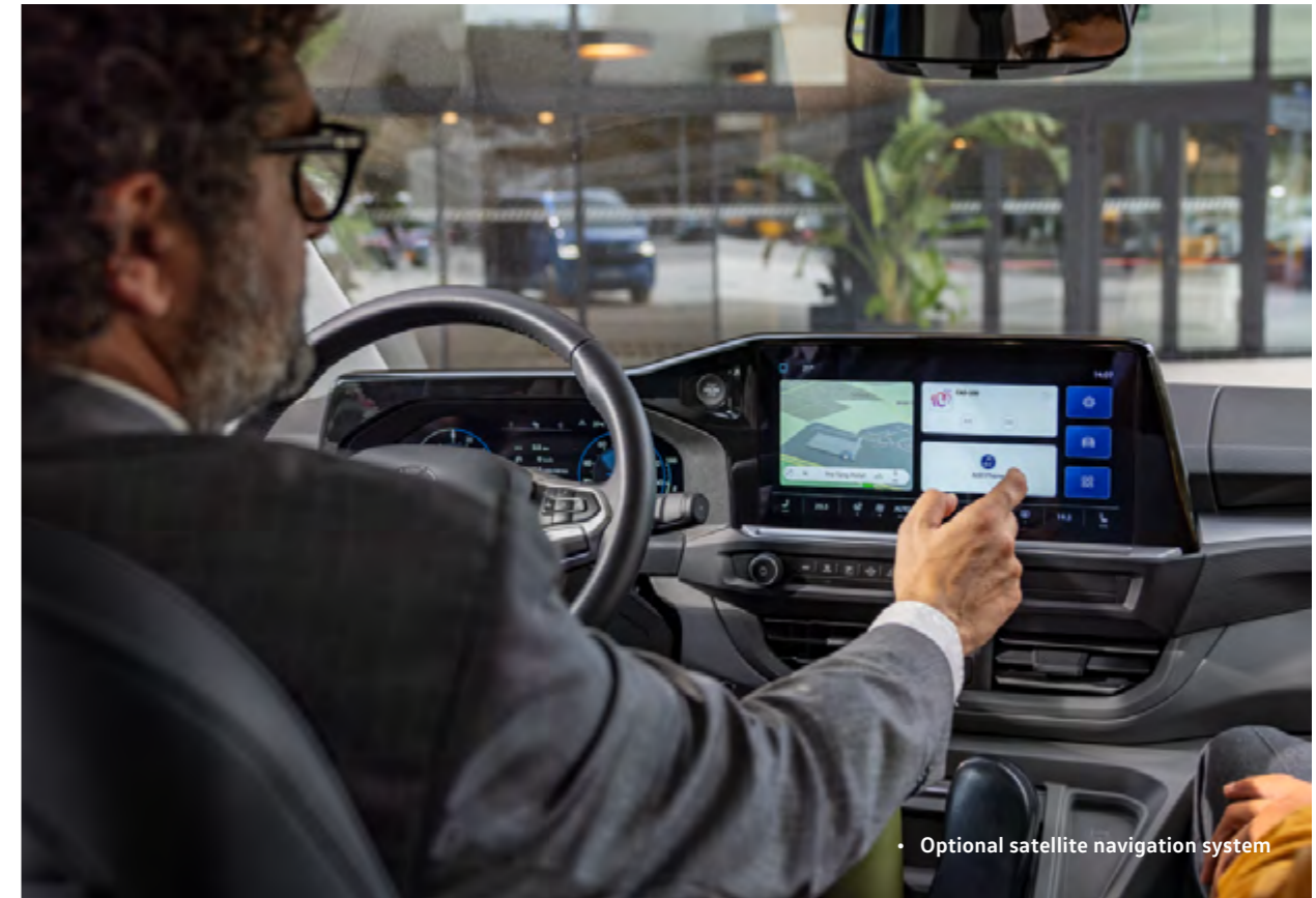
Optional satellite navigation system

Detailed information regarding tyre efficiency labelling and technical specifications on all potential tyre fitments can be found by visiting the Volkswagen Commercial Vehicles online car configurator at www.volkswagen-vans.co.uk/en/configurator.html