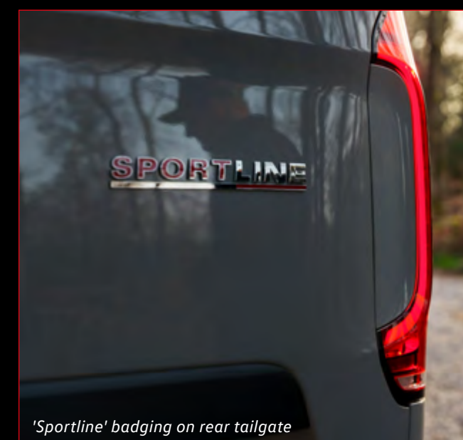
'Sportline' badging on rear tailgate